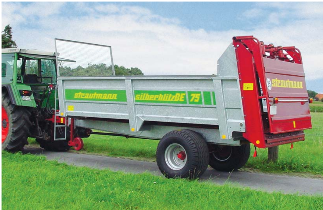
BE 75 with 4-cylinders distributors.