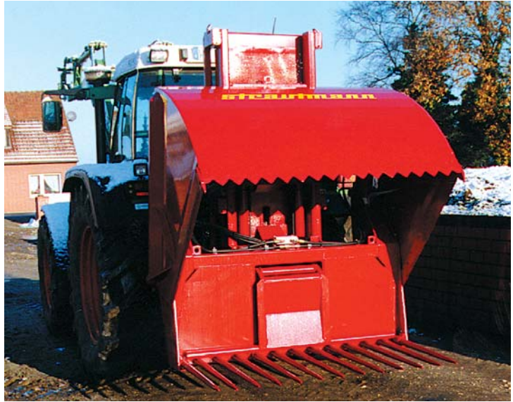
Shear grab SZ 234 for rear fitting