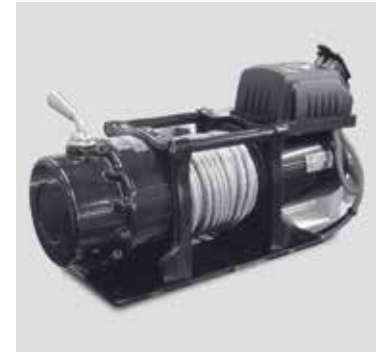
Electric Winch 4500lb (2100kg) Ask your local distributor for details.