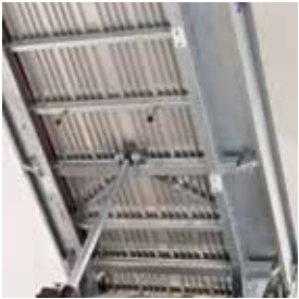
Aluminium Planked Floor

It's the attention to detail on Ifor Williams Trailers that makes our products so popular with owners. Just take a look at these standard features.