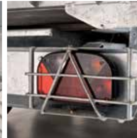
Rear Light Guards