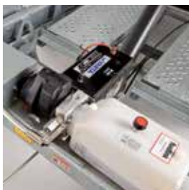
Electric Hydraulic Tip