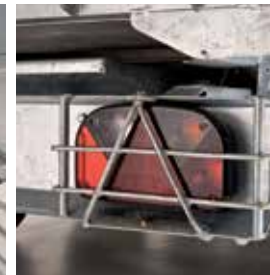
Rear Light Guards