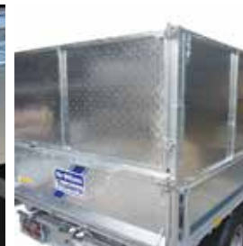
Solid Side Extensions