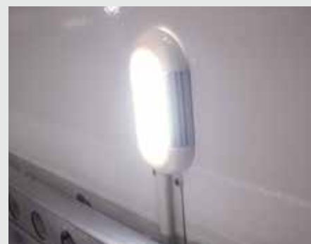
Floor Lighting LED Floor lights for low level illumination.